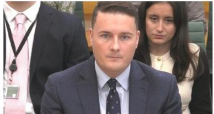
The Rt Hon Wes Streeting MP, Minister of State for Health and Social Care announcing the changes

In March 2025, HM Government announced that NHS England would be abolished, and the 'New' NHS would be under the direct Leadership of the Department for Health and Social Care. The aim is to reduce bureaucracy and create a more effective, productive and successful NHS for the future